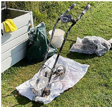
It's Not All Glamour!