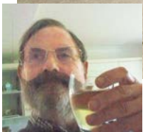
Group activities