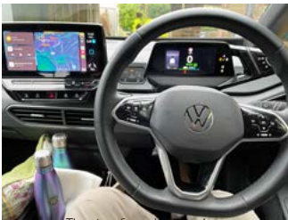
The view from the driver's seat

Golf but it is far superior. There is more room inside and with the very heavy battery under the whole of the floor of the car it makes the vehicle very stable and comfortable to drive. The car weighs a hefty 1.8