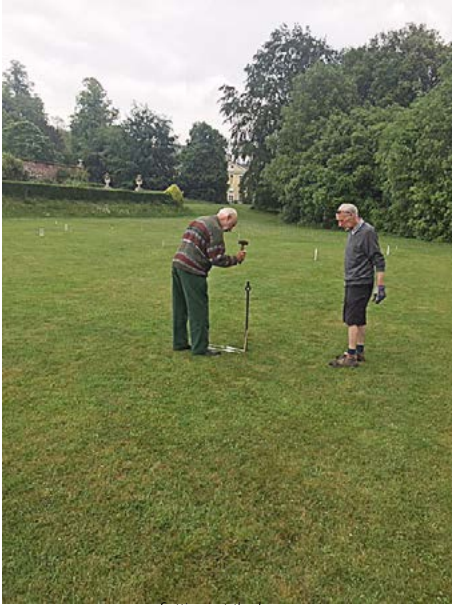
Setting out the Lawns

Mallets have been swung on the croquet lawn at Polesden Lacey for the first time in almost two years by the time you read this and sadly will also have been put away for the winter. We are very grateful