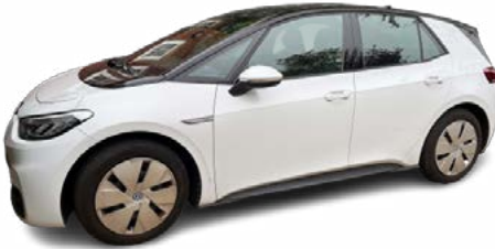
My VW ID.3

I'm still very much enjoying my electric car in fact I would go so far as to say its the best car I have ever had. Up until I took possession of the VW ID3 all electric car, I had been driving VW Golfs for a number of years and the ID3 is to some extent modelled on the